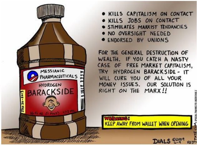
**Cartoons from townhall.com and club member submissions.